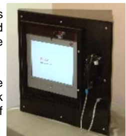
WEDGE BACK BOX

The second MRF wall mount solution features a Wedge design back box exclusively available from Strike for use in areas where privacy and space are a factor. The wedge wall mount back box provides a 30 degree angle to the mounting surface that allows you to control the field of view by rotating the wedge back box 180 degrees.